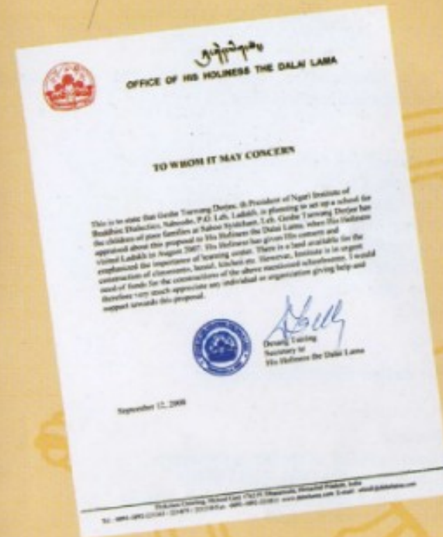
A letter of Recognition by His Holiness The Dalai Lama

SKETCH SHOWING THE FRONT ELEVATION OF PROPOSED BUILDING HALL & V.I.P. ROOM AT NGARI INSTITUTE OF BUDDHIST DIALECTICS AT SUTOKHAN SARDU, LEH, LADAKH, INDIA