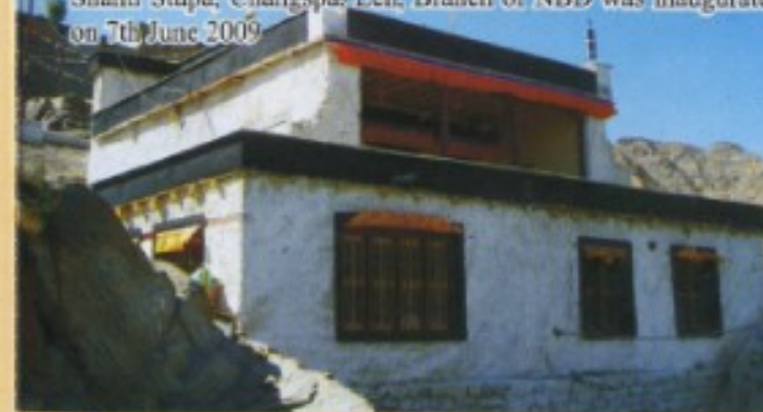
Jamtse Ling Buddha Relic Temple, Located below the famous Shanti Stupa, Changspa, Leh, Branch of NBD was inaugurated on 7th June 2009.