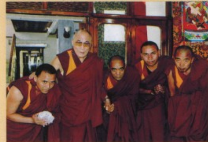
Group Picture of Members with His Holiness THE DALAI LAMA

Providing instruction in Buddhist studies and secular subjects to monks and lay people of the Himalayas